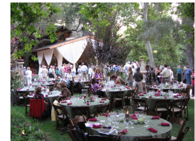
"Garden of Knowledge" Fundraiser sponsored by local businesses and individuals

An annual appeal to the community at large is also made in the late fall.