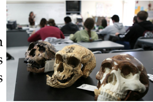
Hominid Evolution Mini-Grant Nordhoff High School

The Ojai Education Foundation funds four program areas on an annual basis: