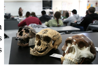
Hominid Evolution Mini-Grant Nordhoff High School

The Ojai Education Foundation funds four program areas on an annual basis: